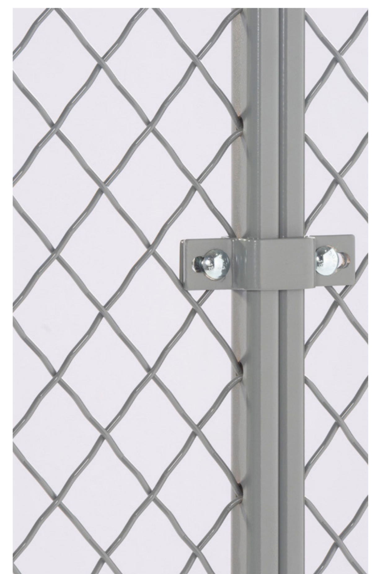
10-Gauge Triple Crimped Steel with Colonel Clamp