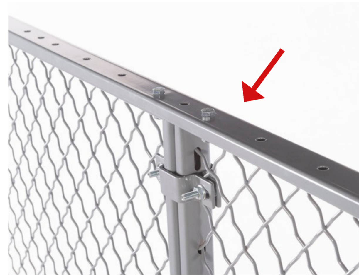
Top Capping Channels