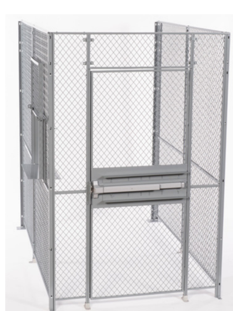
Hinged Panic-Bar Door