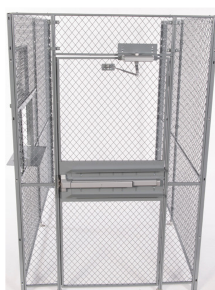
Hinged Door with Closer