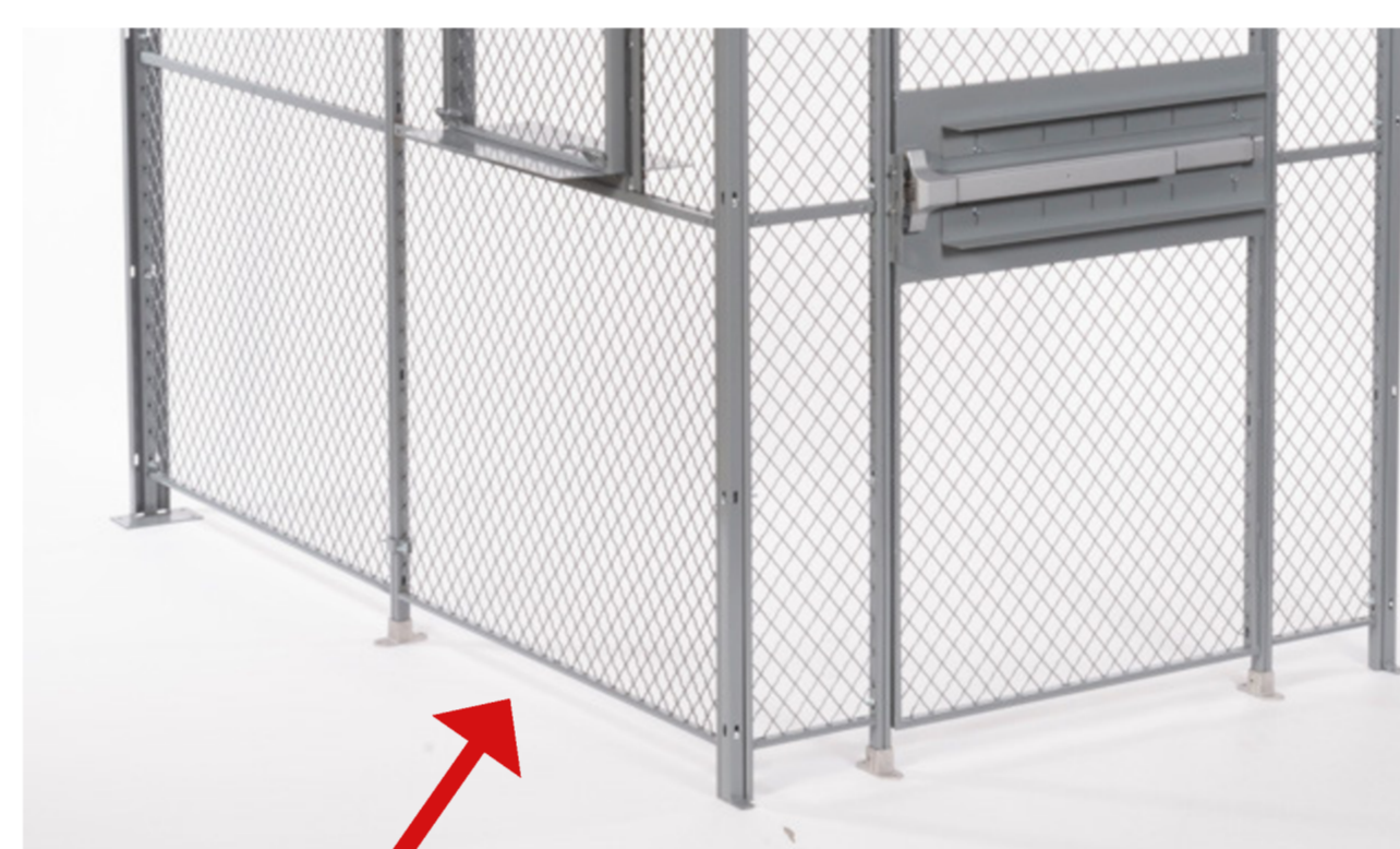
3.7" Sweep Space

Panel frames are interlocked at the corners with mortised and tenon joints then punched with slotted holes for easy installation. Each panel has a 3.7" sweep space allowing for cage housekeeping. A cold, rolled sheet metal sweep guard may be added for high security applications. Another unique feature of FordLogan panels are the 1½" x ½" roll-formed top capping channels that bolt through horizontal frames to enclose wires and provide extra rigidity.