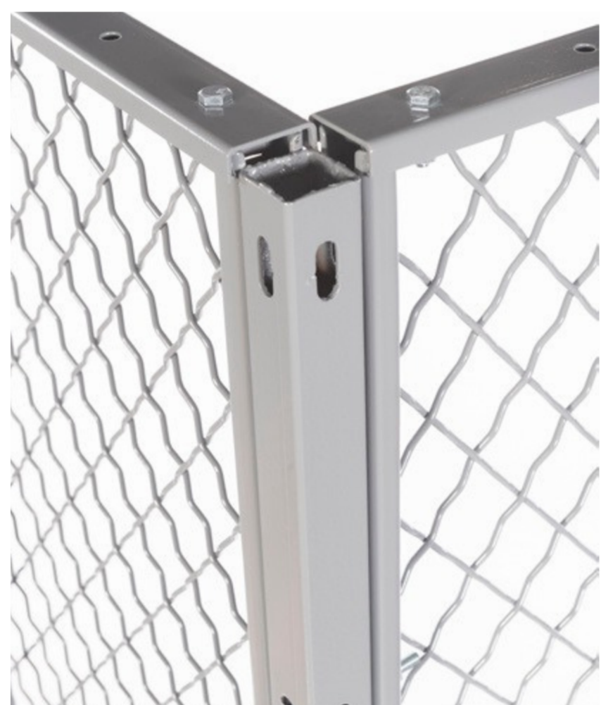
FWP at Corner

It's recommended to use line posts every 15 linear feet on 7' and 8' high systems. But, on 9', 10', and 12' high systems, lines posts are needed every 10 linear feet.