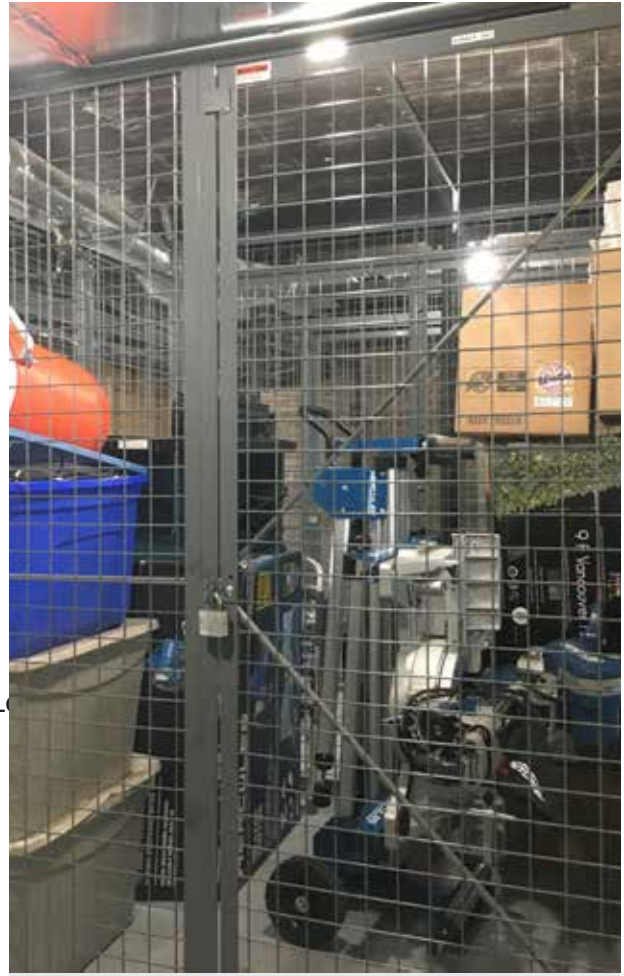
WIRE MESH LOCKERS