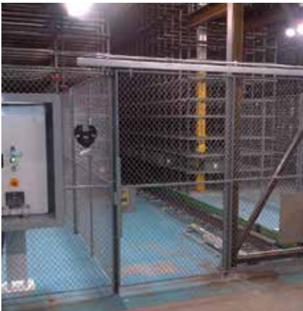
HIGH DENSITY PICK-MODULE