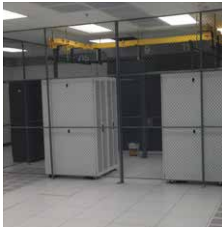
DATA CENTER/ INFORMATION