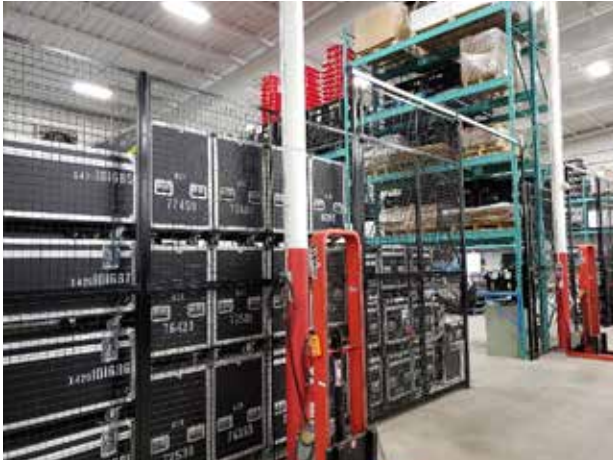
WIRE MESH PARTITIONS